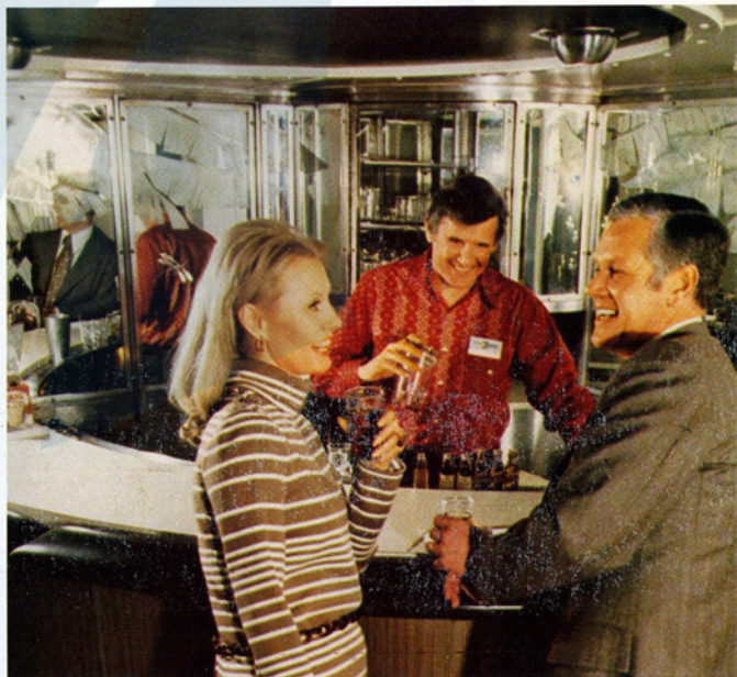
Lots of good low-cost refreshments.