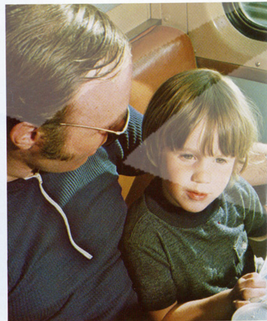
A. The Turbotrain is on its speedy way. B. Metroliner's Metroclub car. C. Father-and-son day, the Amtrak way.